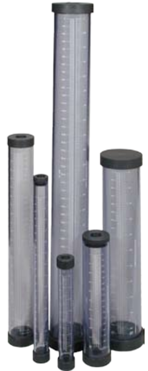
Calibration Cylinders are available in eight sizes.

Cap is sealed with an O-ring and includes an NPT vent connection. Used in applications where frequent cleaning is required, such as polymer, alum, ferric chloride or chlorine.